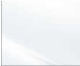
*ARCTIC WHITE QM1