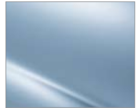
**MISTY BLUE K31