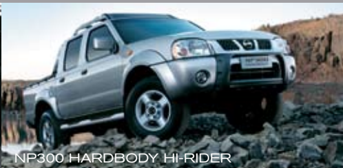
NP300 HARDBODY HI-RIDER