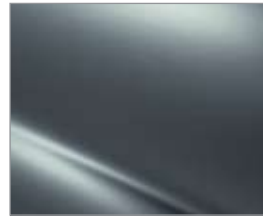
**TECHNO GREY KY5