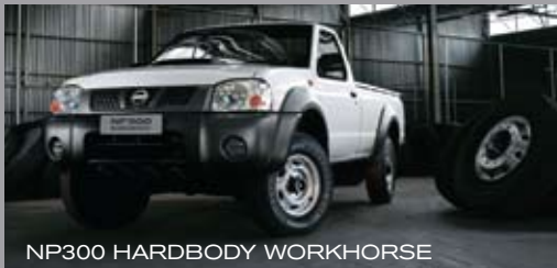
NP300 HARDBODY WORKHORSE