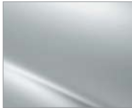
**BRIGHT SILVER KY0